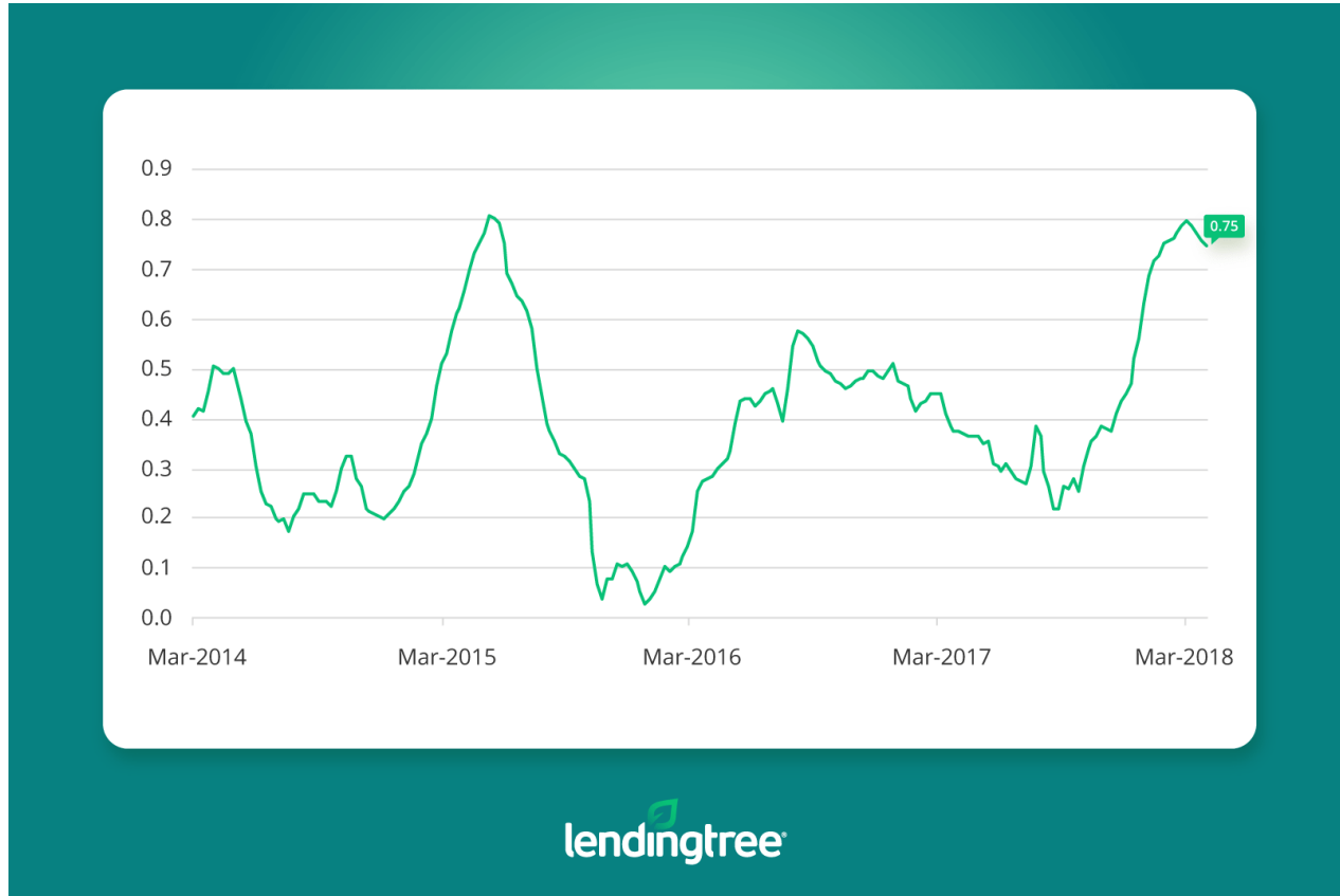
Fig. 2 Purchase and Refinance Price Competition Rolling 52 Week Correlation

We evaluated the correlation of the price competition indices against the following market measures that we believed would be relevant: