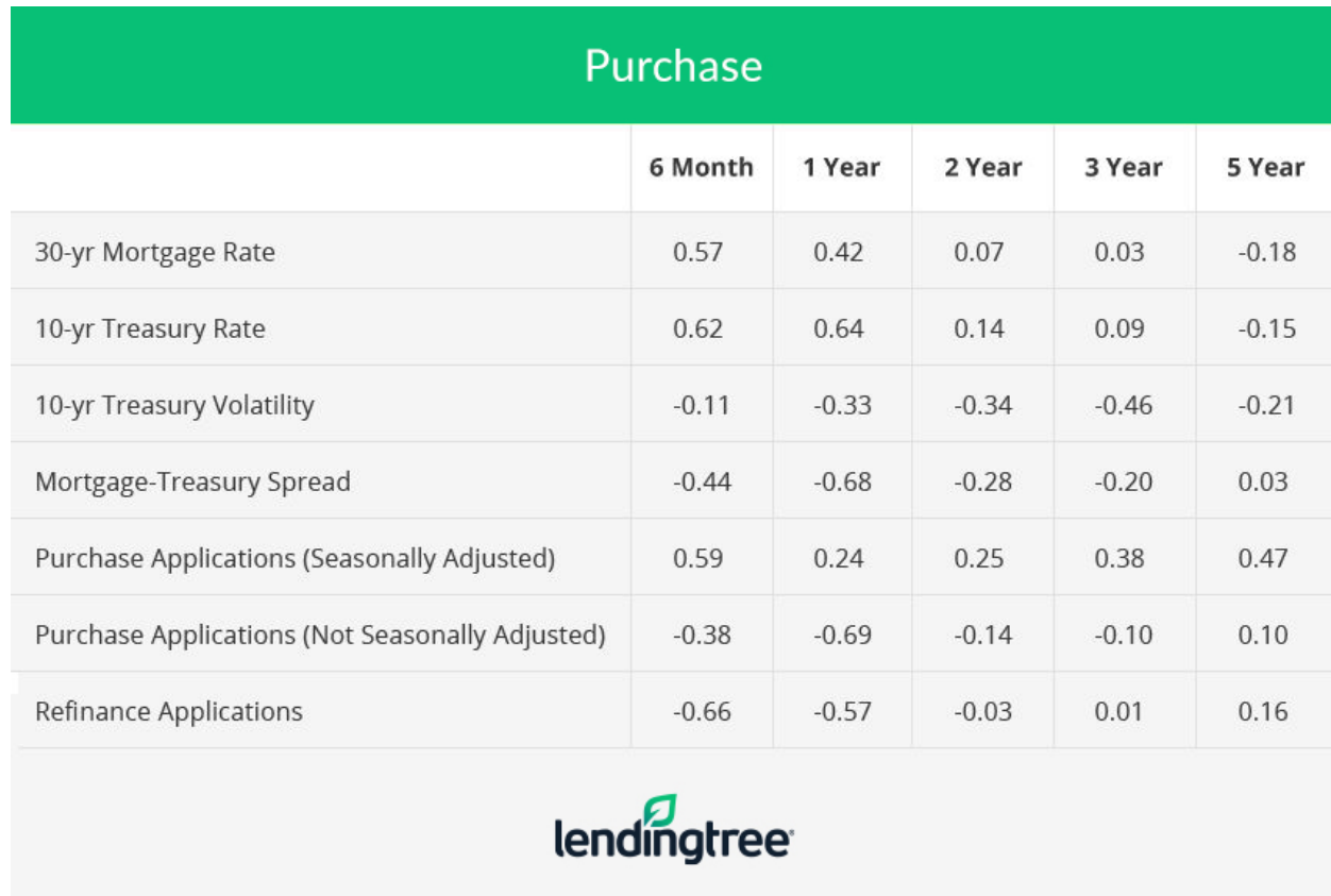
Fig. 3 Purchase Index Correlations With Market Indicators

As with the correlations between the purchase and refinance competition indices, we found variation over time. In different market environments, such as whether one is in a refinance market or not, the relationships vary as lender strategies adjust to the market. Our table shows correlations for our entire 5-year data set. Our discussion focuses on the shorter term measures (6 months and 1 year) as these are most relevant to the current market environment.